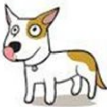
Licking Lips when no food nearby