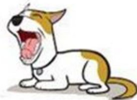
Acting Sleepy or Yawning when they shouldn't be tired