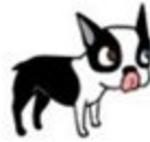
STRESSED nose lick