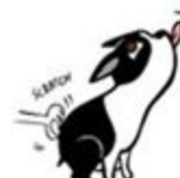
"I LOVE YOU, DON'T STOP"