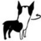
"PEACE!" look away/head turn