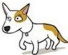
Moving in Slow Motion walking slow on floor