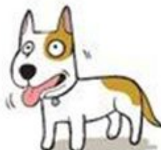
Panting when not hot or thirsty