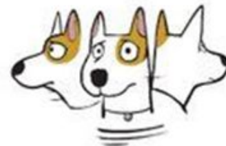
Hypervigilant looking in many directions