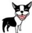
HAPPY (or hot)