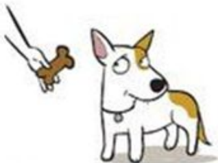
Suddenly Won't Eat but was hungry earlier