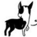
"RESPECT!" turn & walk away