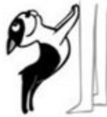
"I'M FRIENDLY!" play bow