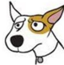
Brow Furrowed, Ears to Side