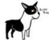
RELAXED soft ears, blinky eyes